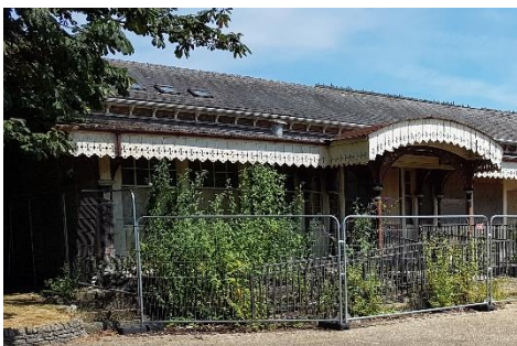
The dilapidated Pavilion Building