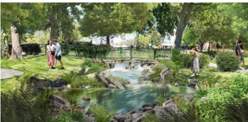
Proposed Visuals (below)