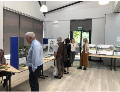
Public Consultation in Tower Gardens Pavilion (above)